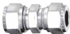
Вид дюймовой арматуры